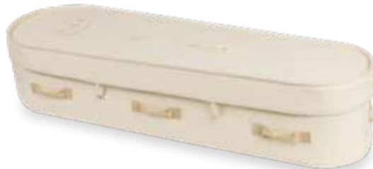
NATURAL LEGACY Woollen $2,992