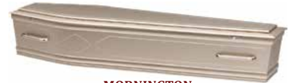
MORNINGTON Bronze $3,454