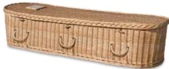
WILLOW Wicker $1,595