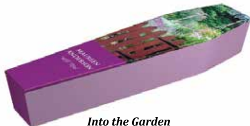
Into the Garden