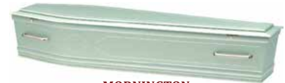
MORNINGTON Mint $3,454