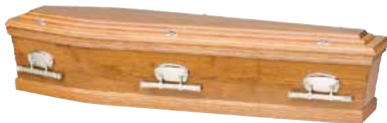
DAYLESFORD American Oak $5,539