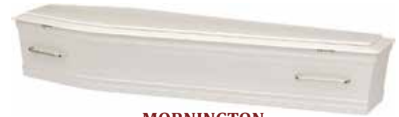
MORNINGTON Ivory $3,454

Our Mornington coffins are customwood coffins with a contemporary metallic, pearlescent finish.