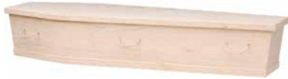
THE ECO Unstained Radiata Pine $2,882