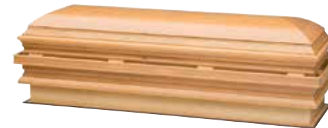
Capsule & Casket