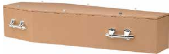
THE NATURAL Recycled Cardboard $1,617