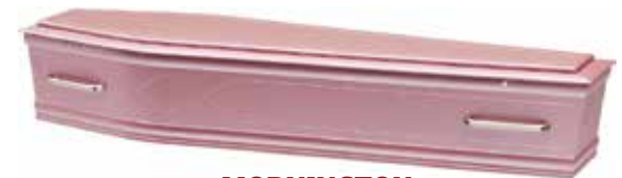
MORNINGTON Blush $3,454